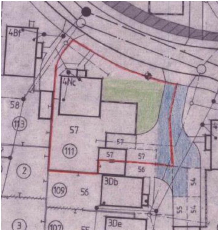
Figure 1 – title deed extract 111 Douglas Road