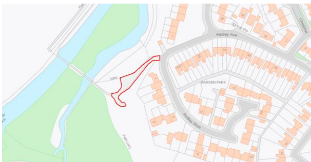
Map above showing dogs on lead area within Audley Rise Car Park