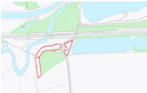
Map above showing dogs on lead area within main car park and catering area within Haysden Country Park