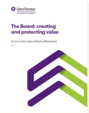
Source: The Board: Creating and protecting value, 2017, Grant Thornton