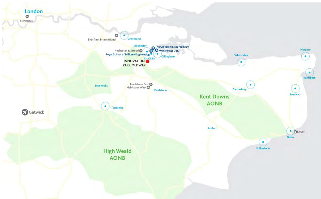
Figure 2 - Location of IPM within the wider context