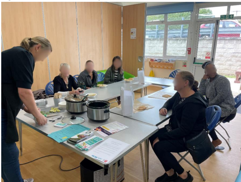
Figure 4 – One of the many Slow cooker courses offered.