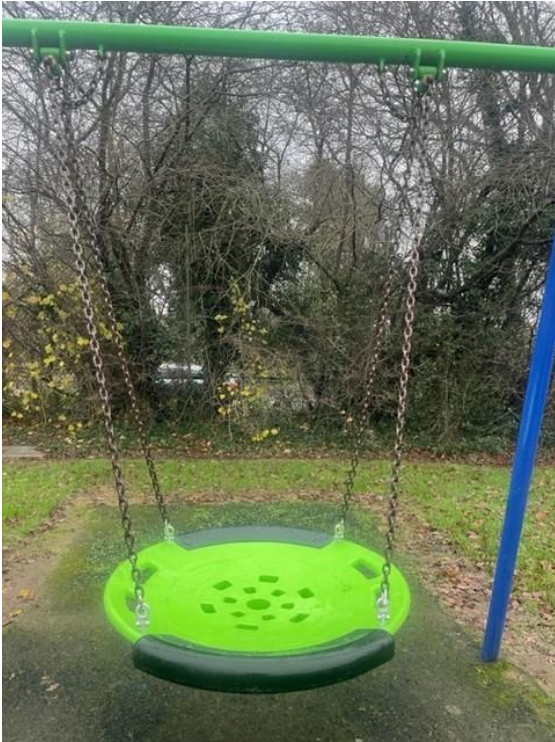
Figure 1 – Swing Seat installed at Taddington Wood