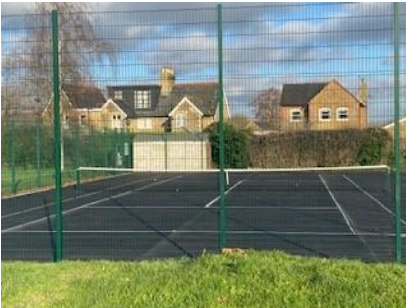
Figure 3 – Resurfacing and Upgraded Tennis courts in West Malling.